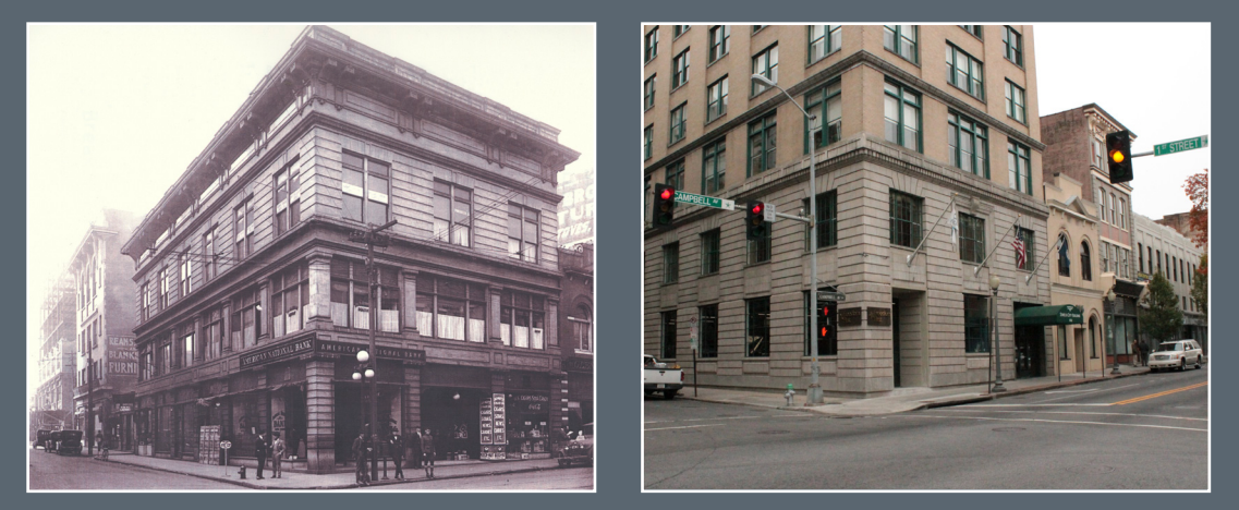
Honoring Our Past. Confident For Our Future.